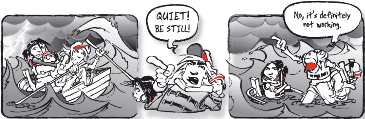
CY Jesus lives